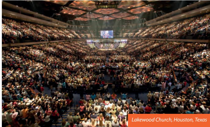
Lakewood Church, Houston, Texas

Evangelical', an auditorium for preaching whose focus is the pulpit; and the 'modern communal', which facilitates the gathering of people for worship and the constitution of community through generous social spaces. 2 Of course, while some buildings fit neatly into these categories, others are a mix of influences; but all, including a ('modern communal?') stadium church like Lakewood, embody theological ideas of who we are before God, and what it means to worship him.