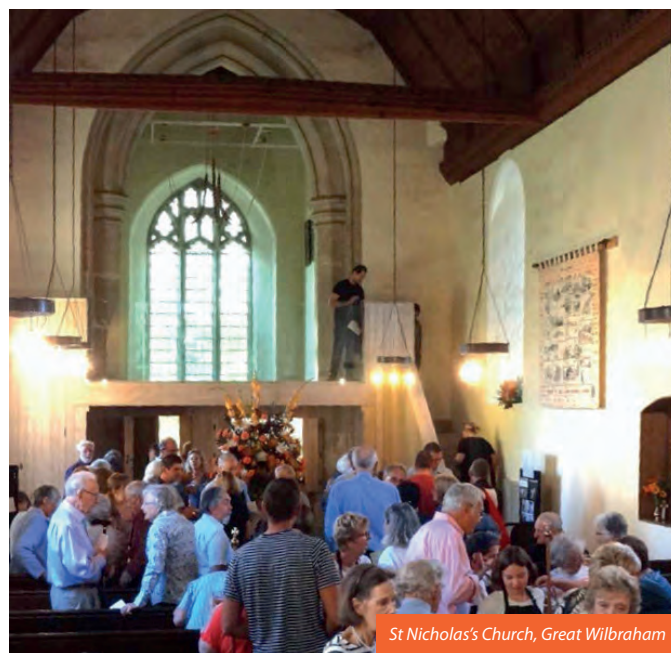
St Nicholas's Church, Great Wilbraham

My practice has recently completed alterations to the listed, medieval St Nicholas's Church, Great Wilbraham. The scheme created a WC and kitchen in the base of the west tower, a new open ringing gallery above and, with the limited removal of some Victorian pews, an open space at the rear of the nave. These changes are unmistakably of their age, with a glass balustrade to the gallery and modern detailing to the oak staircase and partitions. In practical terms, these changes enable the building to host a broader range of community activities (catering included), while extending its narrative by reincorporating an earlier understanding of what church buildings are good for.