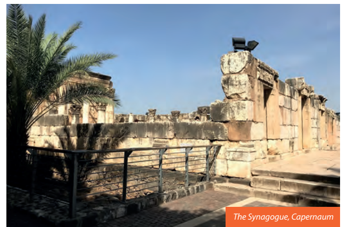
The Synagogue, Capernaum

This concern with place is not limited to the Old Testament; time and again, the Gospels root Jesus' ministry in specific places, many of which have left archaeological traces. For example, one can still visit the synagogue in Capernaum where Jesus preached (Mark 1:21–28); though the standing ruins in lighter stone are a later rebuilding, visible beneath these is the black basalt base of what is believed to be the first-century synagogue. Standing there, it is hard not to be moved by the placed connection with Jesus' own ministry, the remains literally earthing the Gospel narrative. And just