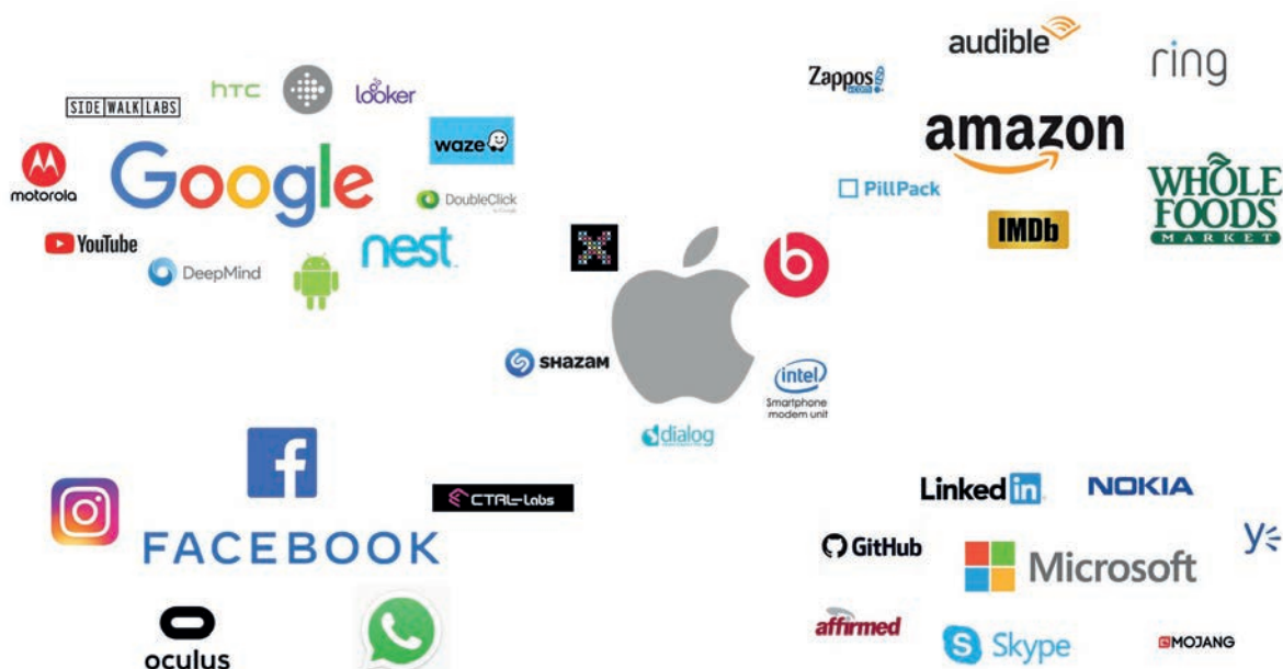
Authors’ representation of key brands associated with some leading technology companies (2020)

Surveillance capitalists have been eliminating competitors (through lawsuits and acquisitions) and extending their reach through complementary products and services.