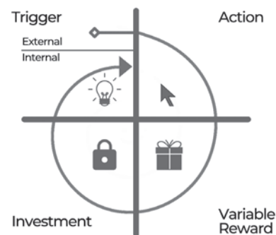
'Hook' model - Nir Eyal 2014

Investment - resulting in another 'trigger'.